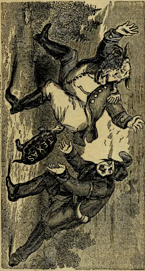
JOHN BULL OPPOSED TO ANNEXATION.